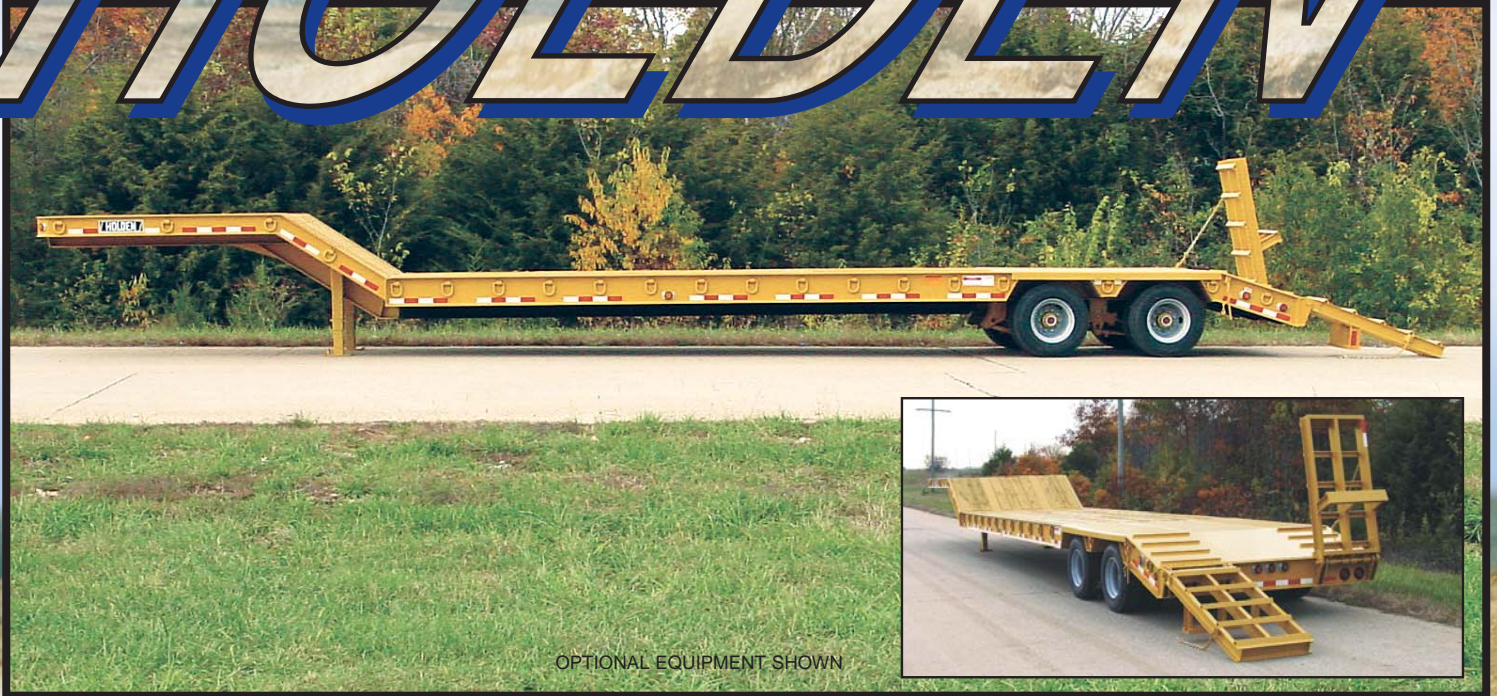
OPTIONAL EQUIPMENT SHOWN