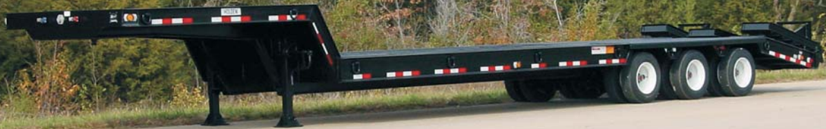
OPTIONAL EQUIPMENT SHOWN