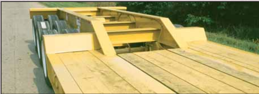
OPTIONAL EQUIPMENT SHOWN